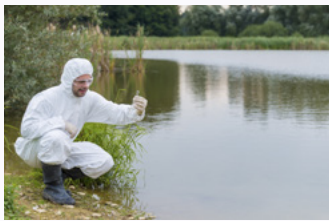
Pollution & Environment