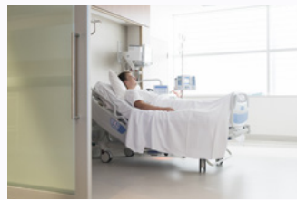
Biomedical & Health