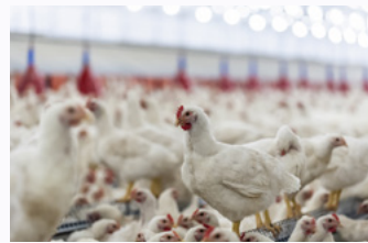
Food / Pharma / Veterinary / Industry