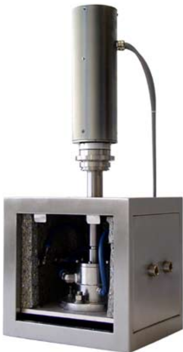
UIP2000 with flow cell/sound protection

operating needs the generator is located in a housing or in a cabinet and is equipped with control displays as well as with electrical interfaces. Important applications for the UIP2000 are the intensive cleaning of continuous material such as wires, tapes and profiles, of single components or bigger bores. Sonotrodes are chosen to match to the application. The treatment of sewage sludge for a better gas yield, the production of very fine emulsions and suspensions, the extracting and homogenizing as well as the reducing of germs are applications with this device in large scale. Corresponding sonotrodes e.g. the cascade sonotrode provide the required intensity of ultrasonic treatment of the liquid. Corresponding flow cells are offered for continuous operation. Sound protection casings complete the ultrasonic system based on UIP2000.