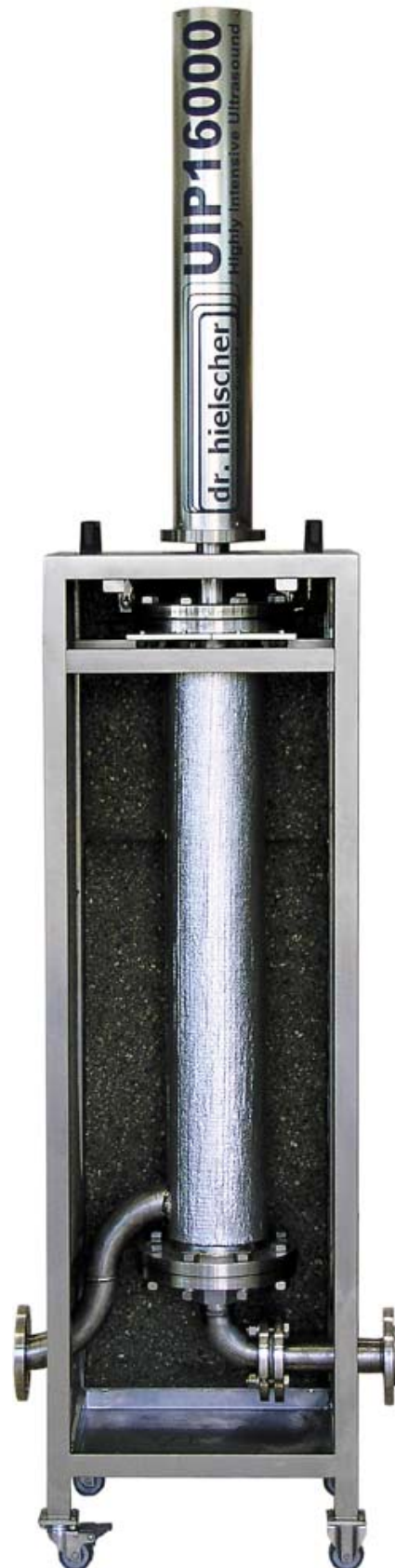
UIP16000 with flow cell/sound protection