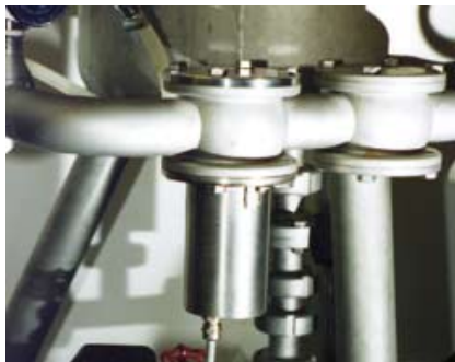
UIP50 for the cleaning of sensors

The ultrasonic processor UIP50 with a power of 50 watts and a frequency of 30kHz as well as the UIP250 with 250 watts and 24kHz are alternatives to the laboratory devices with similar power. They are used for hostile operation conditions. The robust aluminium housing of the transducer with its degree of protection (IP54) withstands dust, dirt, higher temperatures and humidity. The generator, supplied in a housing or as plug-in module for a cabinet, can be located outside the hazard zone.