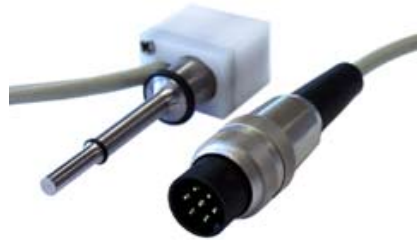
UIP12 (90kHz) as OEM-component

textile ribbons directly at the loom. If the ultrasonic processor is manufactured as handheld device both an ergonomic friendly design and the safety standards e.g. in the medicine or food industry have to be considered.