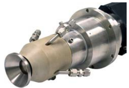
UIP1000 with sonotrode for nebulizing