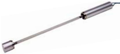
UIC1000LB with long blade (800mm)