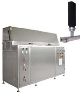
wire-, tape- and profile cleaning