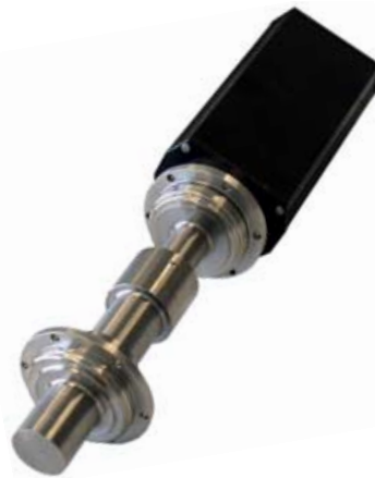
UIP1000 and sonotrode with flange

For use in the food or pharmaceutical industry, these ultrasonic processors are available with stainless steel housings.