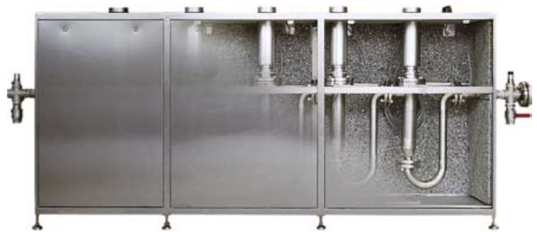
10kW ultrasonic flow system/sound protection (5 x UIP2000)