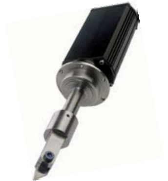
cutting and welding