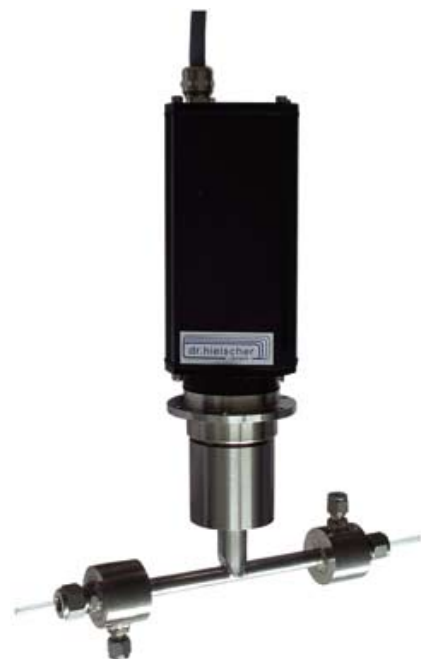
UIP250 with mini flow cell

The oscillating-free flange of the transducer permits positioning accurately in machines or robot arms. For the sonication of liquids at higher temperatures of up to 300°C and pressures of up to 300 atm we offer longer sonotrodes with pressure-tight flange connections.