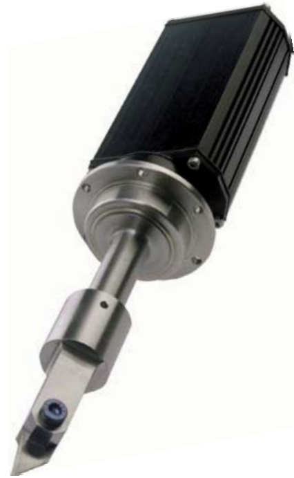
UIC400 with short blade

Exchangeable blades, which are selected to the cutting criteria of the respective application case such as the material, shape and length, are used as tools. The ultrasonic processors can also be constructed for the use in the food industry.