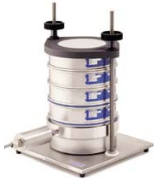
ultrasonic sieving in the laboratory