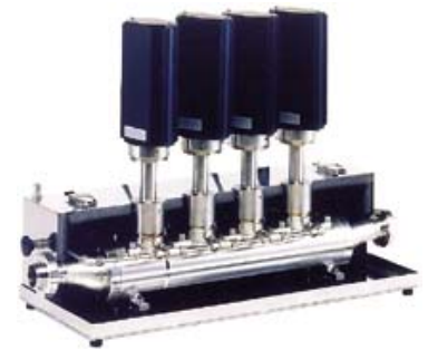
flow cell for food (4 x UIP500)