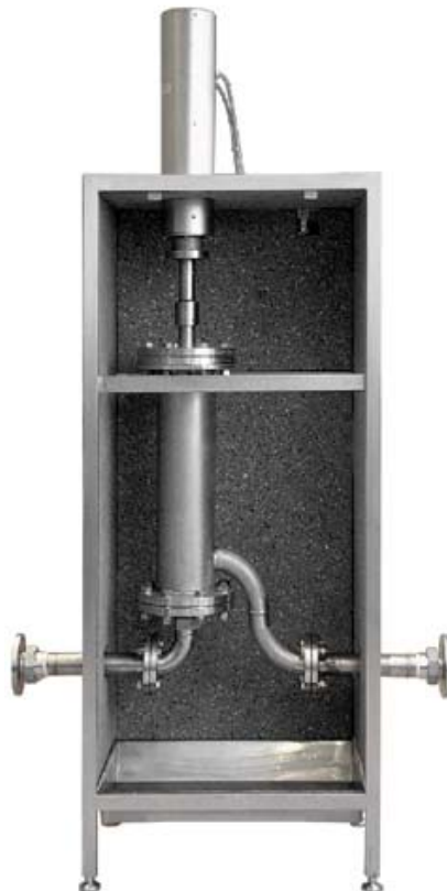
UIP4000 with flow cell/sound protection