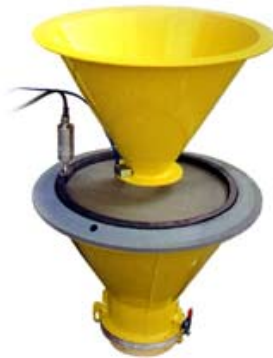
industrial ultrasonic sieving