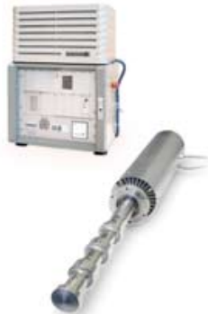
ultrasonic industry processors