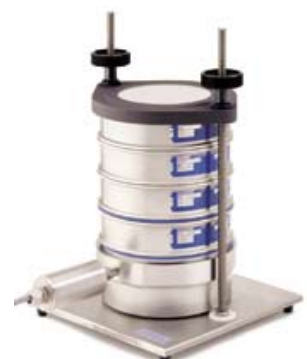
UIS250L at lab sieve tower