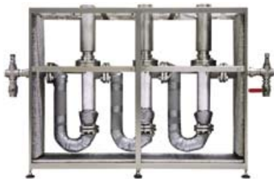
ultrasonic dispersing systems