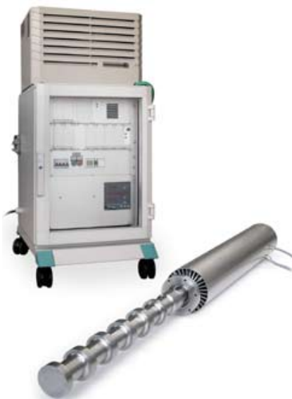
UIP8000 generator and transducer

The robust design of the transducer allows the use also under rough conditions. The processor can also be equipped with explosion proof. The generator is housed in a cabinet of coated steel or stainless steel, which is adapted to the respective safety requirements and climatic conditions. Therefore we can also construct the version with an independent cooling system, that completely avoids the contact between aggressive air in the production site and the electric components of the ultrasonic processor. The operation of the ultrasonic processor can be controlled and monitored by means of power meters and status displays as well as via electric interfaces.