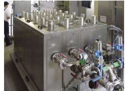
48kW flow system (24 x UIP2000)