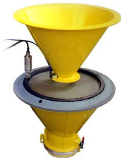
UIS500 at sieve frame

lar to the construction of the laboratory sieving tower, the transducer is also installed outside the industrial sieves. Therewith a contact between the material to be sieved and the transducer is avoided, which is an advantage, in particular decisive regarding thermo-sensitive powder. The transducer can also be supplied as ex-proof version. Please ask for our detailed sieving information for laboratories or industries.