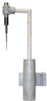
UIP50 as OEM-component