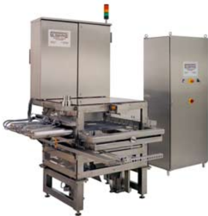
ultrasonic cutting system (8 blades)

The ultrasonic processors UIC400, UIC500 and UIC1000 with a power of 400, 500 or 1000 watts, respectively, and a frequency of 20kHz are developed especially for cutting tasks. This cutting method is nowadays a proven technique, in particular for cutting plastic sheets, textiles, cardboards, rubber, plastics and food. In general ultrasonic cutting means the excitation of a cutting tool or of the counter-bearing. The main advantage is the significant better cutting quality. Lower feed force permit higher cutting speed. Sludge cakings at the blades are removed by the ultrasonic oscillations. The lower wear of the tools and the resulting longer durability have a cost-saving effect.