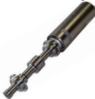
UIP2000 and sonotrode with flange