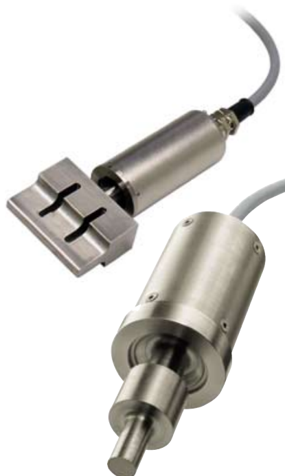
UIW300 and UIW800

With such ultrasonic energy, the thermoplastic material will be preheated and becomes soft or liquid. This effect is used for forming and connecting the individual materials. It is also satisfactory, if only one component is thermoplastic or if a thermoplastic adhesive is applied between the components. The advantage of the ultrasonic welding compared to thermal welding is a shorter time cycle, a higher quality, lower energy consumption as well as the avoidance of heat and damaging steam effects. The ultrasonic processors weld straight pieces or surfaces. The sonotrodes i.e. the welding heads can be customized according to the geometry of the lines or surfaces. The