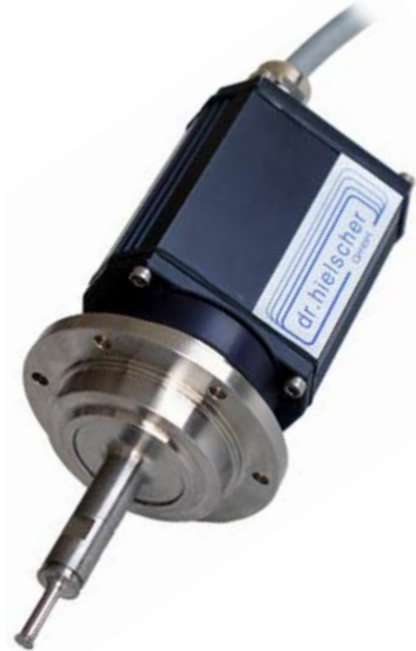
UIP25 with sonotrode for nebulizing