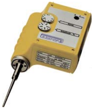
ultrasonic laboratory processors