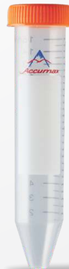
15 ML 17000 g