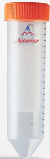
50 ML 20000 g