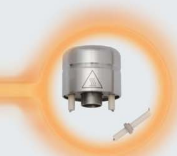
Removable & decomposable burner head, autoclavable, made completely of stainless steel and ceramics