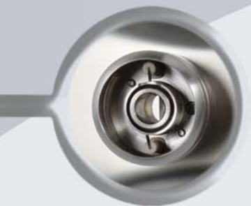
Burner shaft can be opened at the flick of a wrist for cleaning purposes