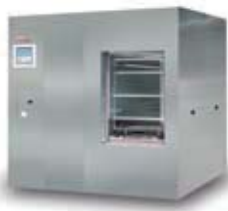
Large Capacity Sterilizers for Medical Use

Featuring Tuttnauer's range of cleaning, disinfection and sterilization solutions