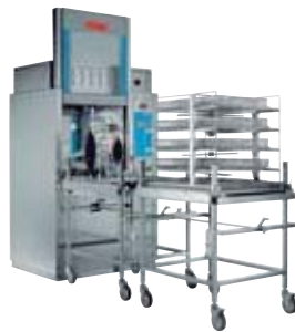
Washer disinfectors for hospitals and laboratories