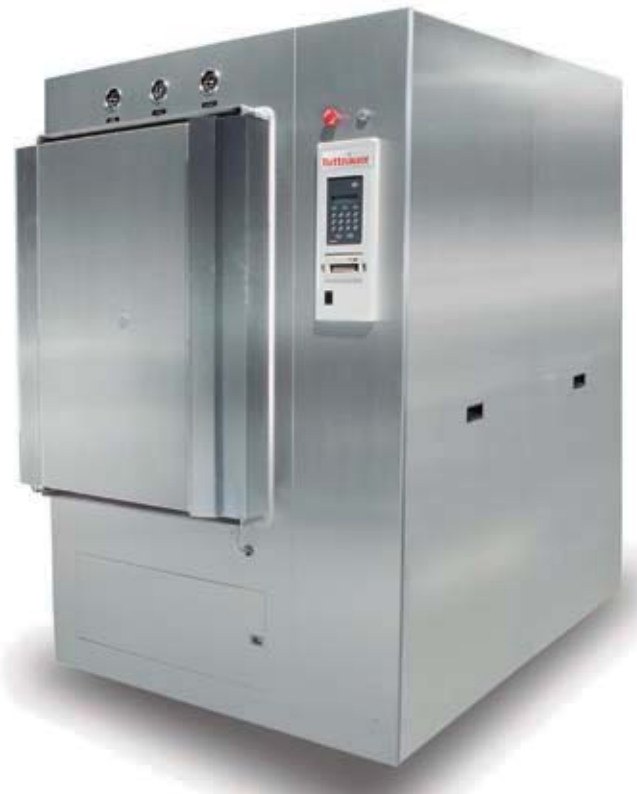
Automatic Hinged Door