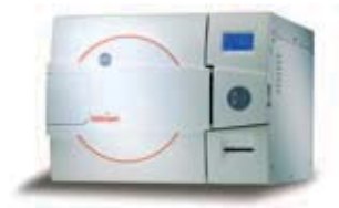
Pre & post vacuum tabletop sterilizers designed to perform class B cycles