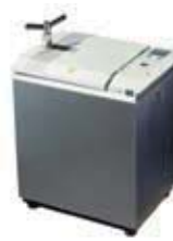
Laboratory autoclaves ranging in size and application