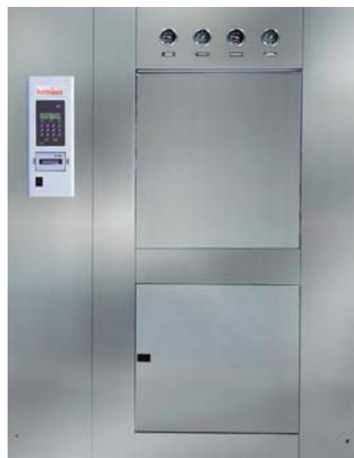
Manual Hinged Door