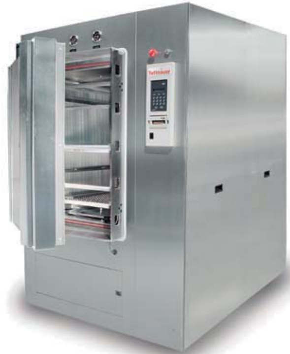
Automatic Hinged Door