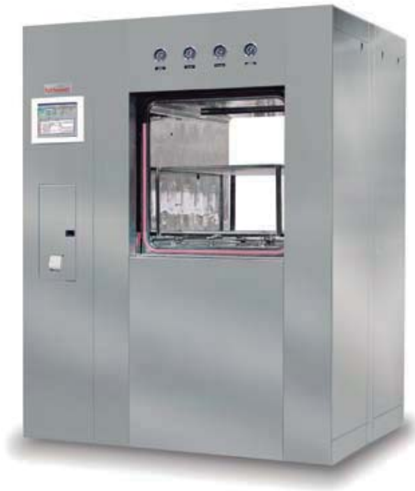
Vertical Sliding Door