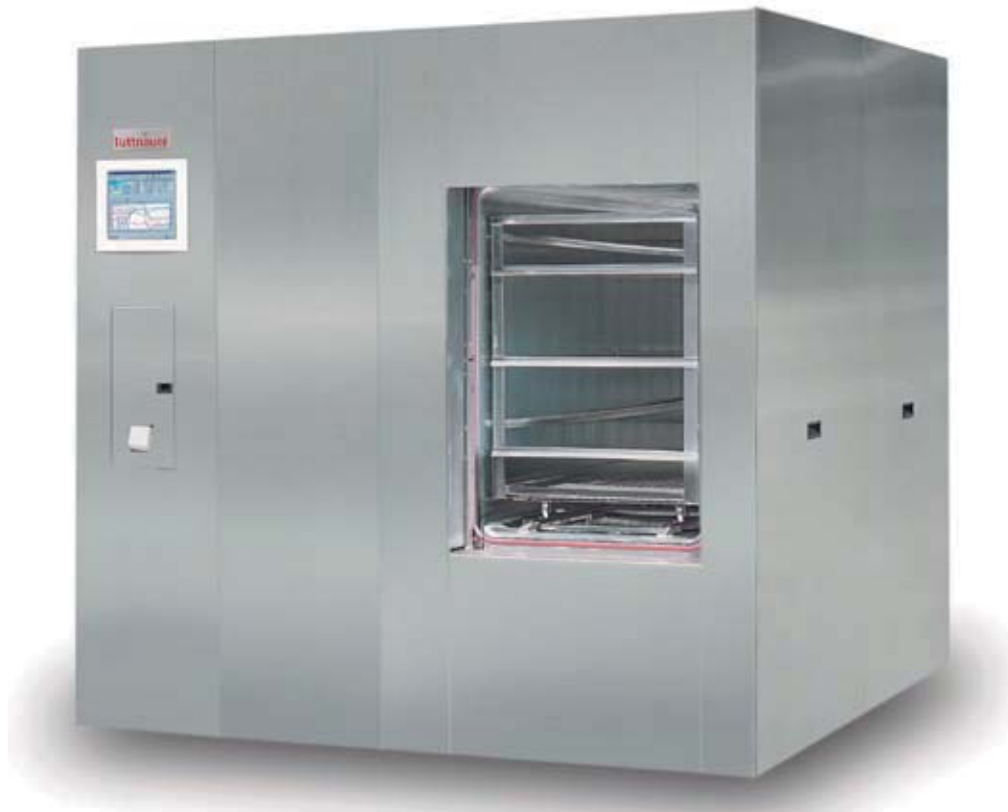
Horizontal Sliding Door