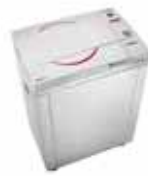
Vertical autoclaves for liquid, glassware, and biohazardous waste