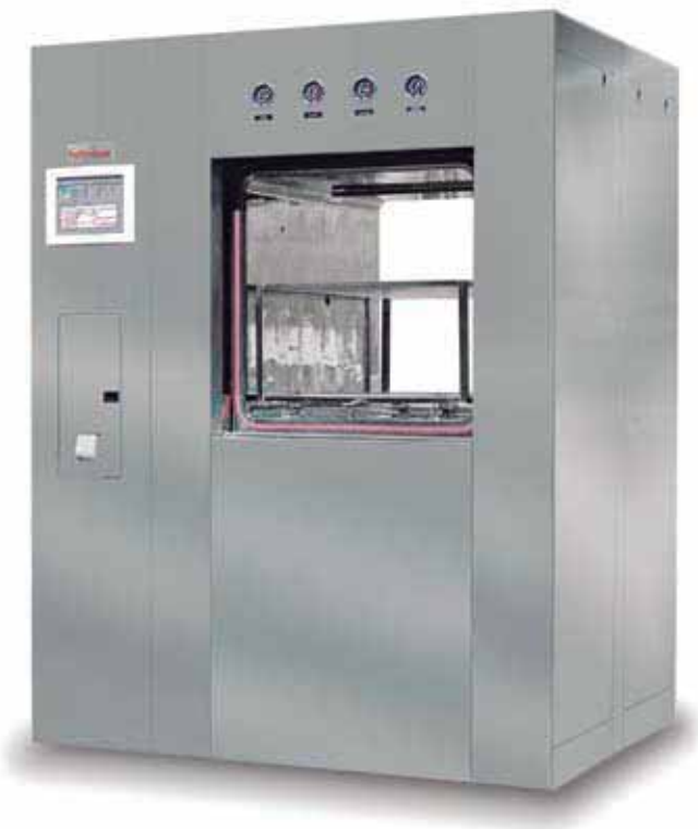
Vertical Sliding Door