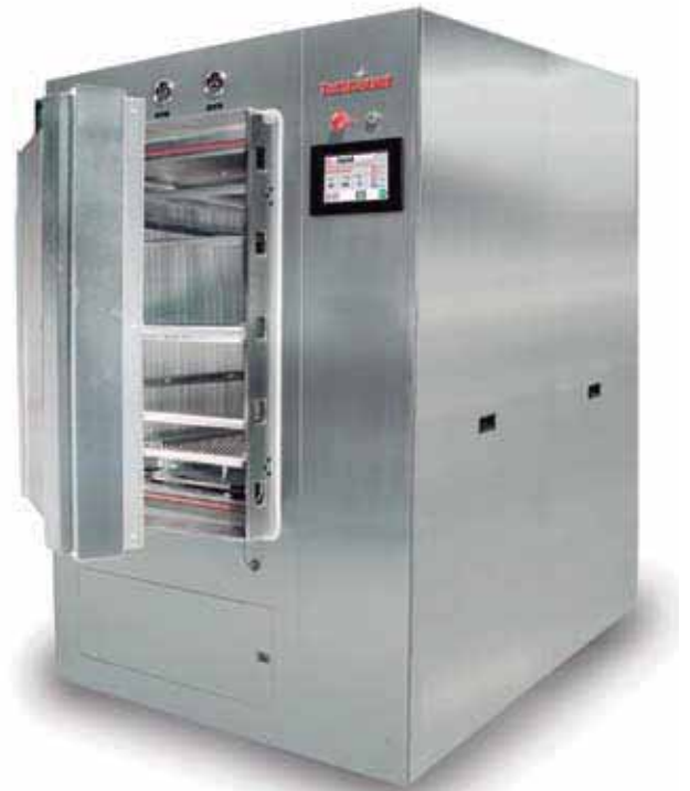
Automatic Hinged Door