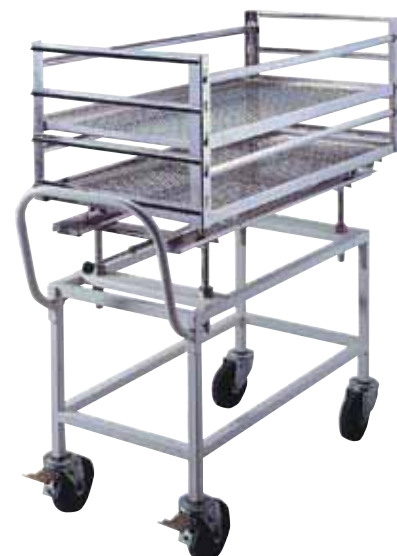
Loading Cart on top of Transfer Carriage

Automatic Loader: Designed for loading/unloading. The control of the loader is integrated with the control of the autoclave.