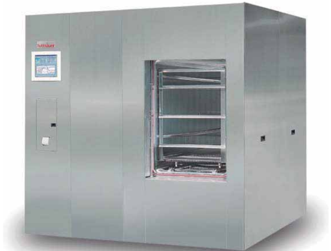
Horizontal Sliding Door