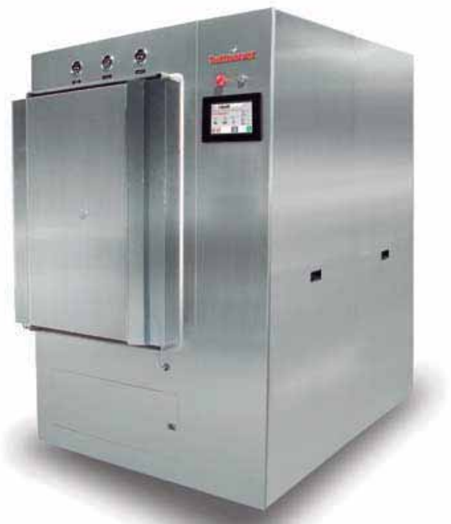
Automatic Hinged Door