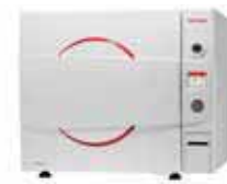
Benchtop autoclaves for life science applications