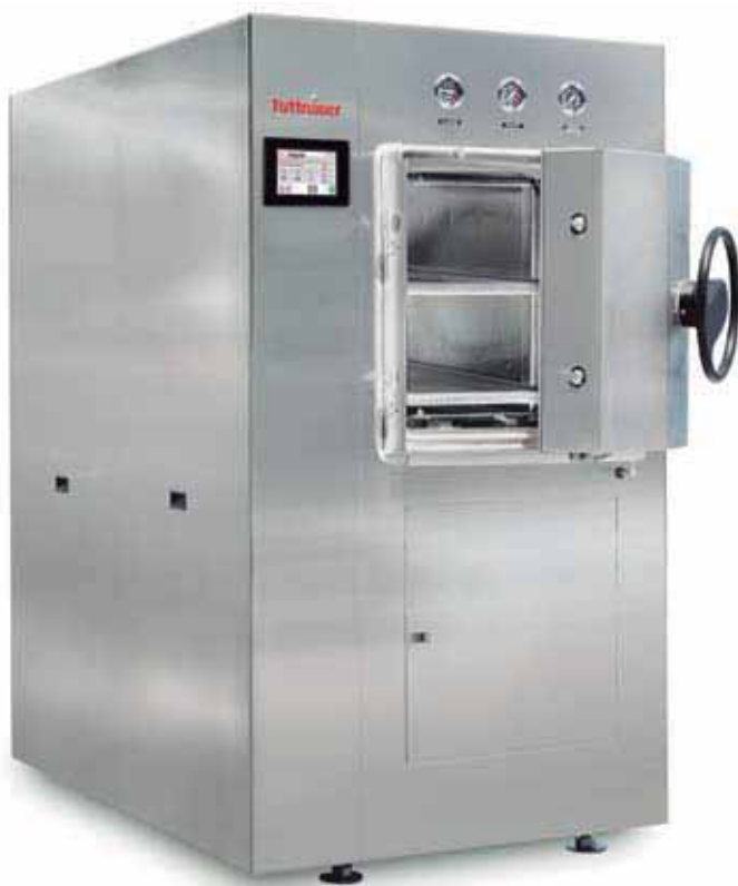
Manual Hinged Door