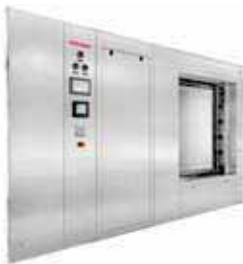
Pharmaceutical autoclaves designed in accordance with cGMP guidelines