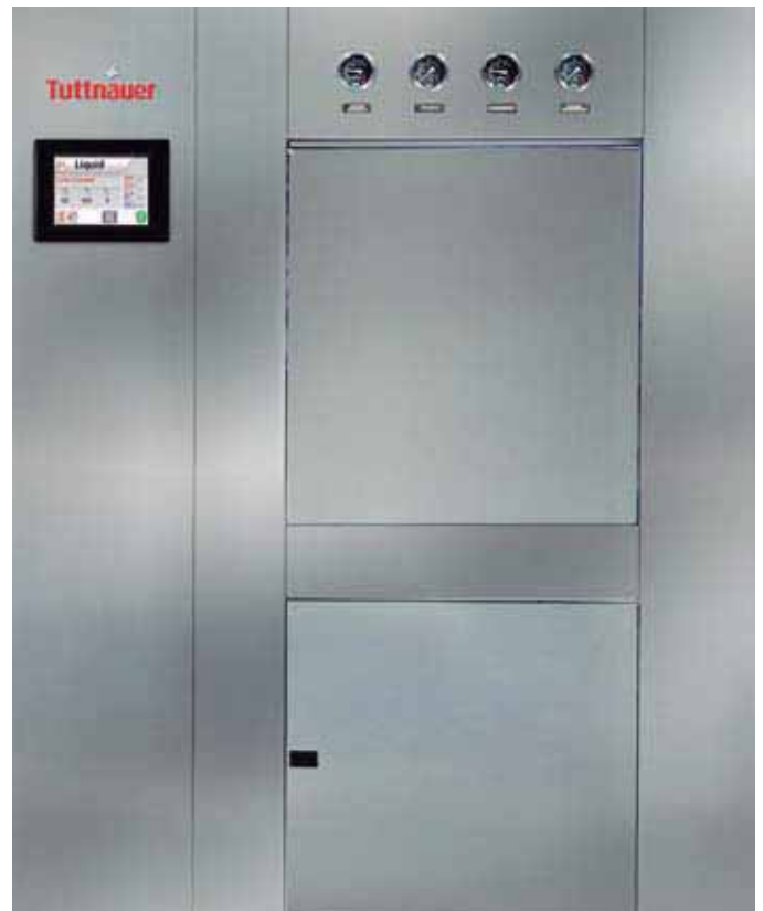
Vertical Sliding Door