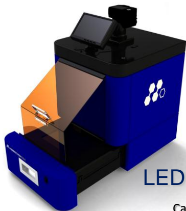
LED Light source