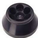
Refrigerated High-Speed Centrifuge Z 36 HK

max. Speed: 30000 rpm max. Volume: 6 x 250 ml Example rotor: Angle rotor 6 x 250 ml