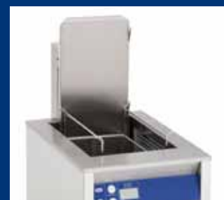
Hot air dryer