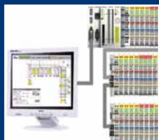
Operating panel designed as touch panel