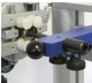
Diamond engraving position