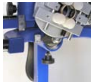
Setting of stretching device