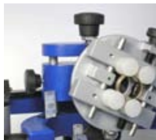
Setting of engraving size