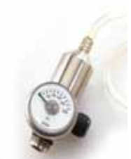
Test gas cylinders and regulators