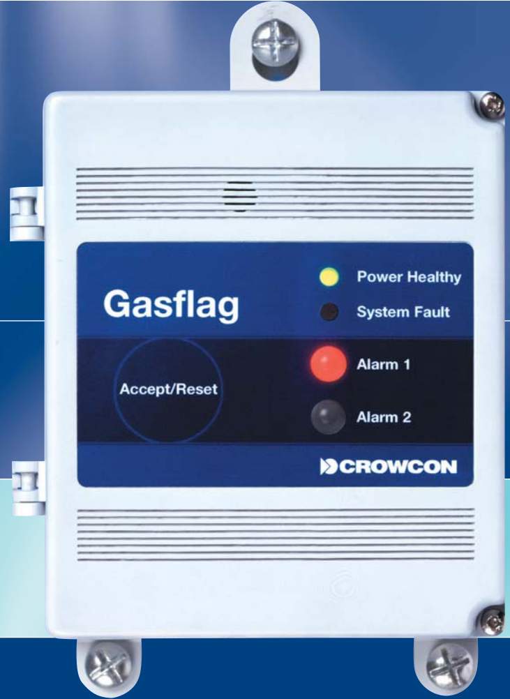
Single Channel Control Panel