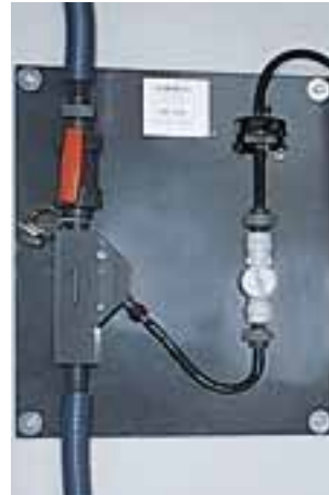
PF 105 sample bypass